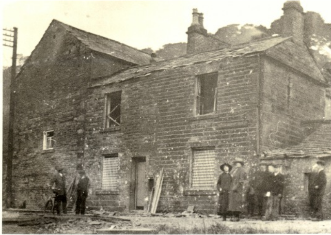
Holcombe Post Office 1916