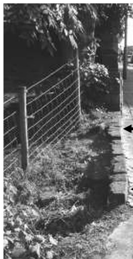
Remains of the boundary, Church Fields above Bar

Use an extra sheet if you need to, but number your additions - eg 'Qn1 continued'. Please sign and date any extra sheet.