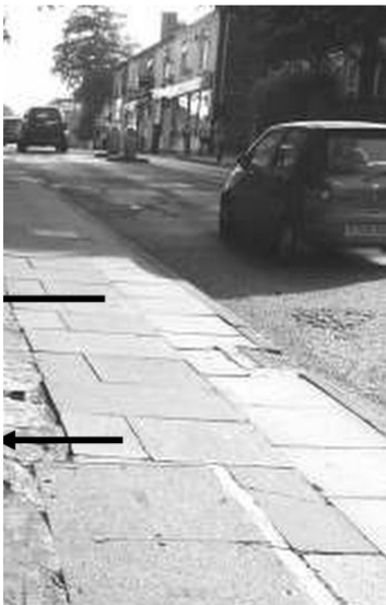
y wall between Bolton St and wood Lodge House, July 2013

Do you have friends, relatives (including children) or neighbours in Ramsbottom who could fill one in?