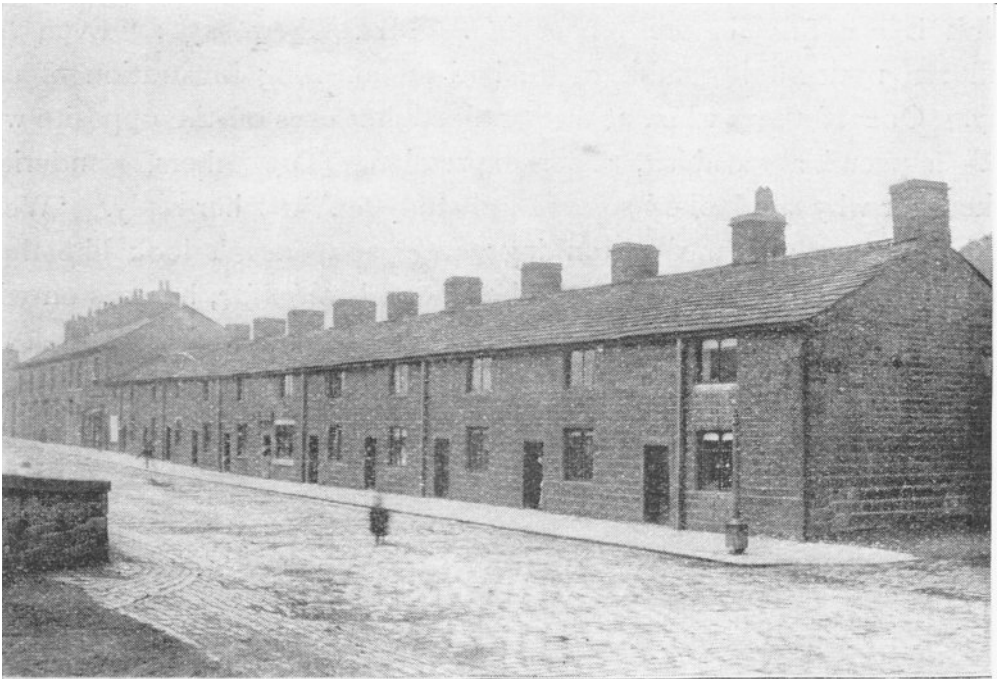
TWELVE ROW, RAMSBOTTOM.

When he moved with his parents to Twelve Row he was first connected with the Wesleyan Chapel. Disagreements, expulsions and withdrawals within the Methodist